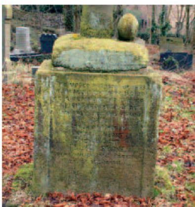
The Toches Stone 684 ad

Continue along the road past the memorial Lych Gate, erected in 1920 to honour villagers who gave their lives in the First World War. Walk past Lodge Farm (a splendid example of a farmhouse with combined shippon) then onto the renovated Chapels Barn. Over the wall past the barn can be seen Chapels Farm, another listed 17th century farmhouse. A few yards further along on the left is the Church of St Stephen, with a Lych Gate erected in honour of a former Mayor of Blackburn. At the bottom of the churchyard notice the old school and the outdoor stone pulpit which dates from 1910.